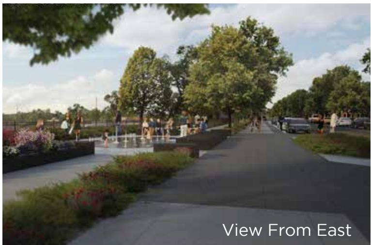
View From East